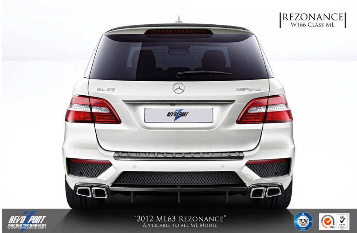
REZONANCE W166 CLASS ML