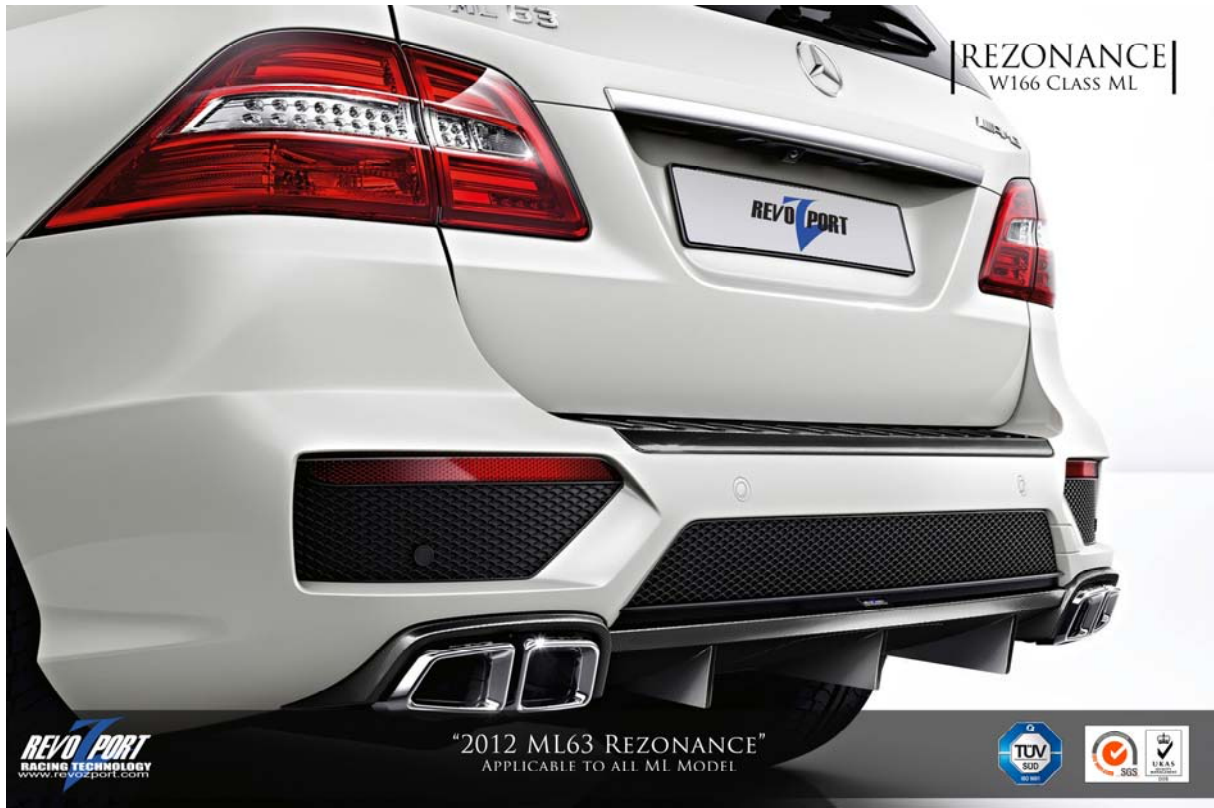
REZONANCE W166 CLASS ML