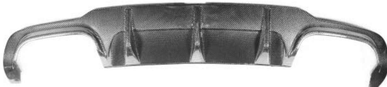
Facelift Rear Diffuser