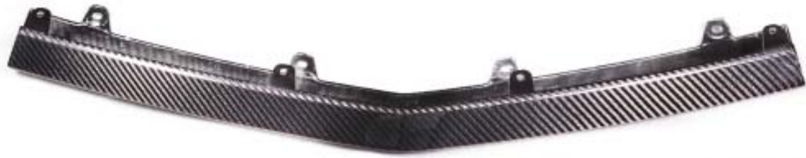
Front Bumper Strip