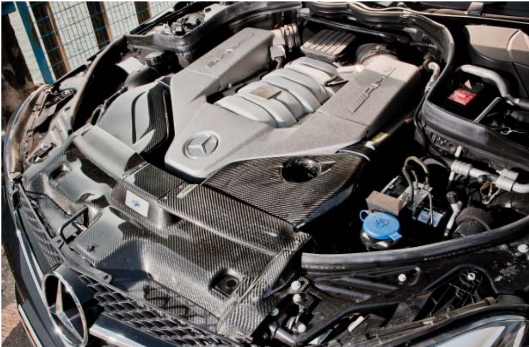
C63 Carbon Induction System for "C63 (2007-2013)"