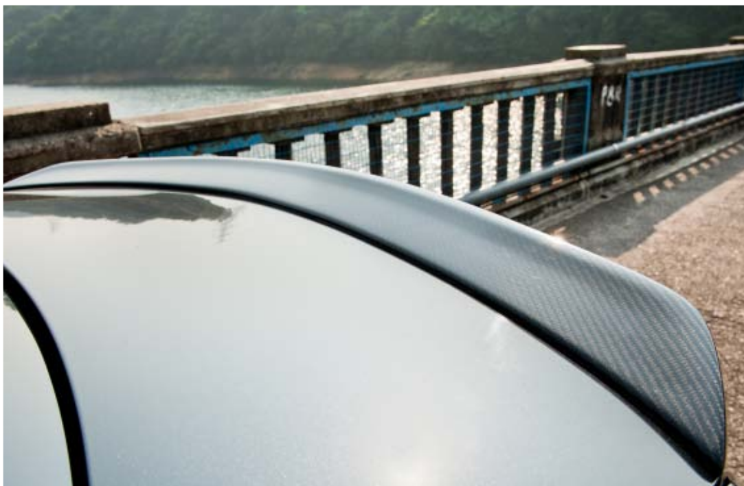
C63 RBS II Trunk Spoiler