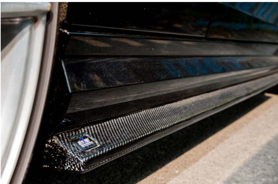
C63 RBS II Side Skirt Set (set of 4pcs)