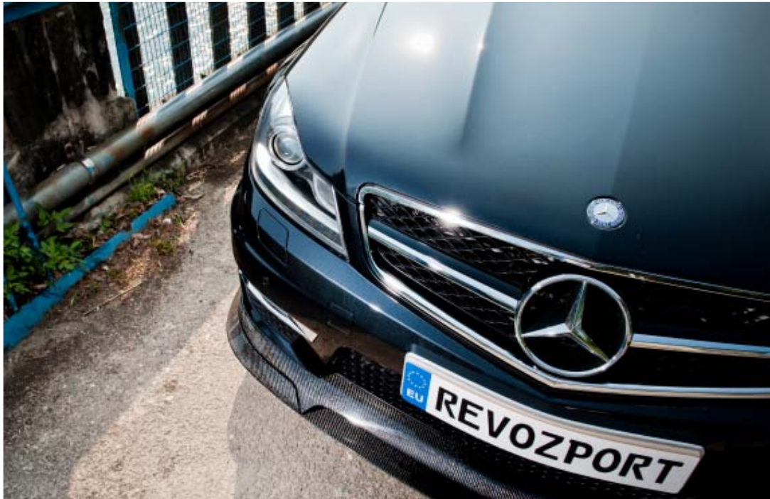
C63 RBS II Front Splitter