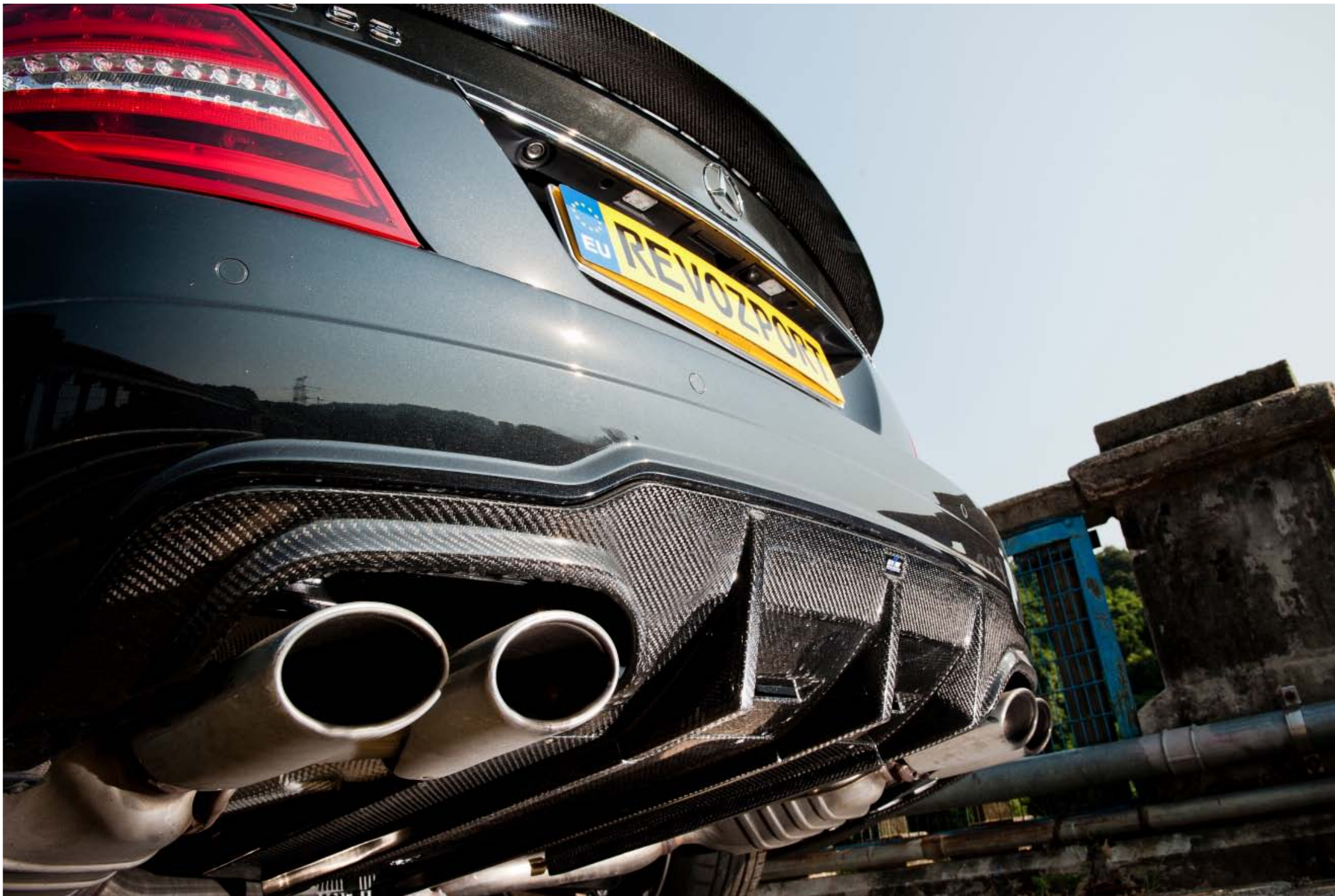
C63 RBS II Rear Diffuser with Ground Effect Panel (Coupe / Sedan Only)